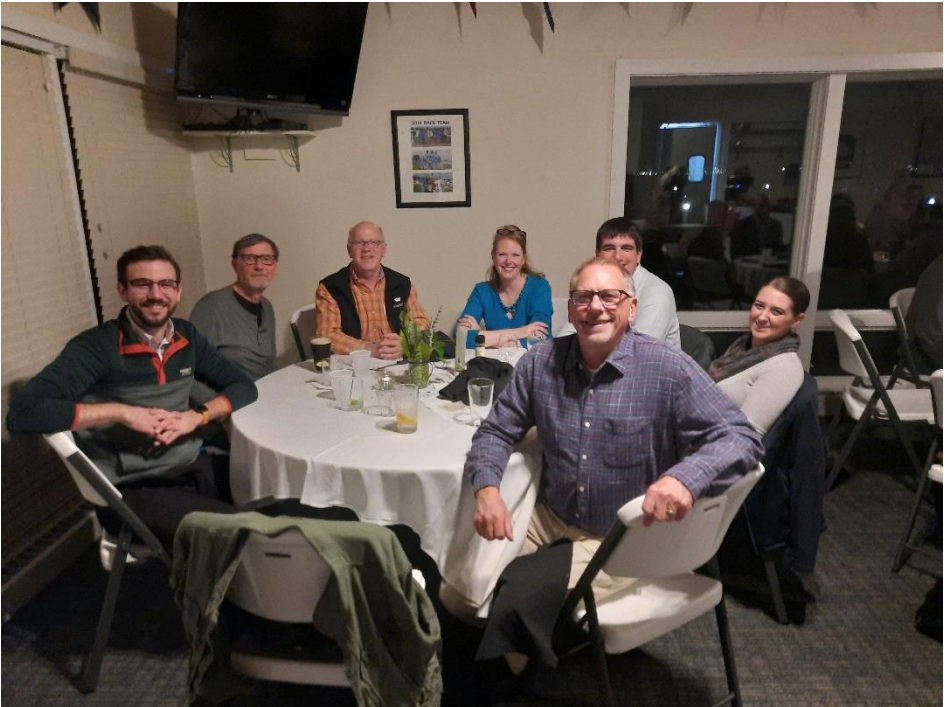
Awards Banquet 2022

Registration closes Wednesday, January 25, 2023. Walk-In registrations are not allowed.