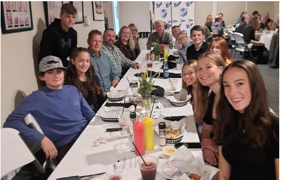
Awards Banquet 2022