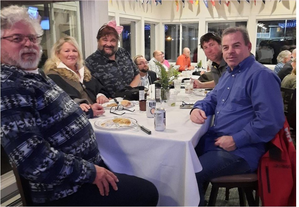
Awards Banquet 2022