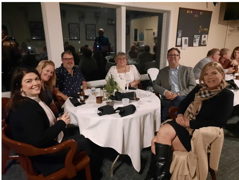
Awards Banquet 2022