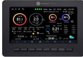
Display inside the clubhouse