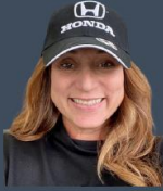
Rookie of the Year Candidate