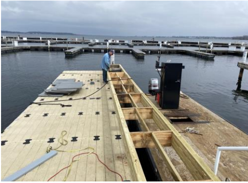
Building the new finger pier.

Dock & Yard has a long list of “To-Do’s” that need to be completed before boats splash and will require help from many volunteers.