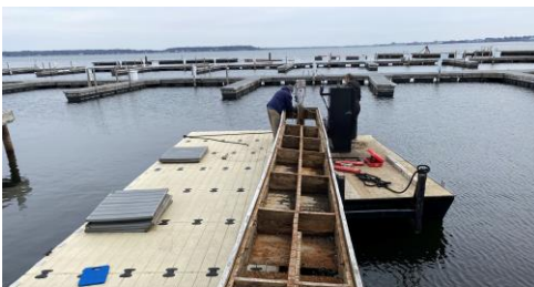
Stripping and removing sections of the old finger pier.

Recently Dock & Yard began reconstruction of the severely warped finger pier between slips 70 and 71 as part of our long list of spring improvements. Volunteers worked Saturday and Sunday to remove the old finger pier and begin reconstruction of the new one.