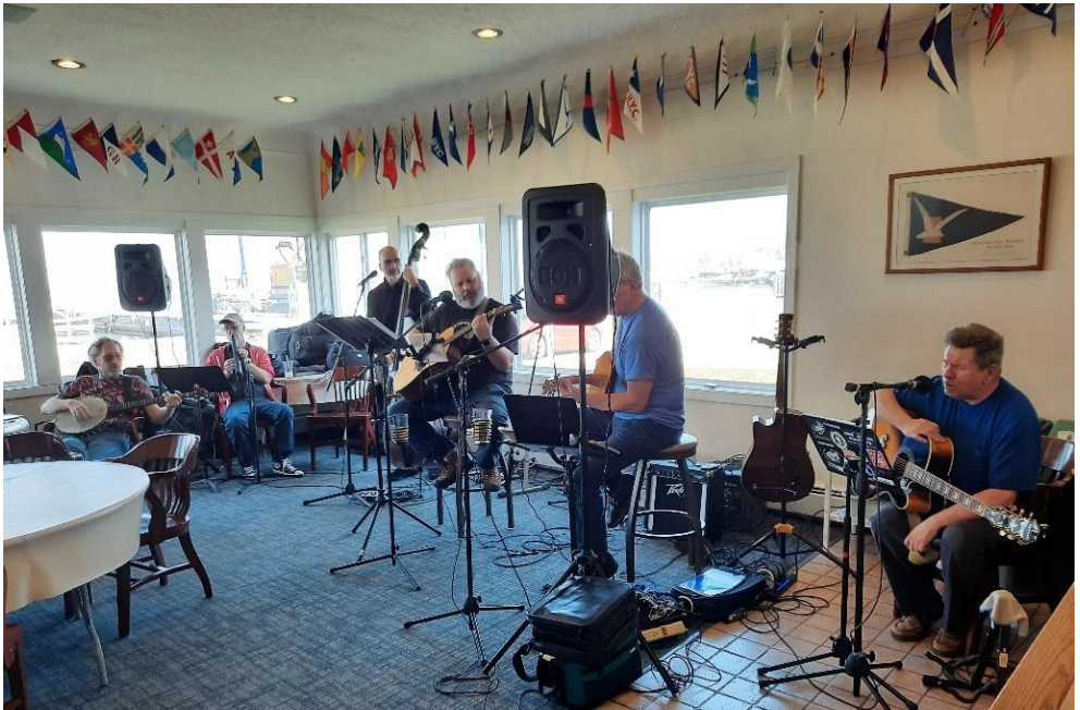
Jam Session on 4/3/22

IN A WORLD WHERE YOU CAN BE ANYTHING BE KIND