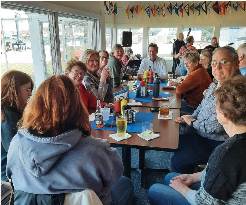
Members enjoying the last Jam Session