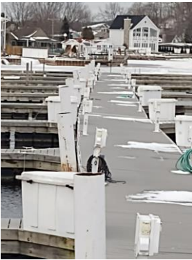
“B” dock bending from the ice

Winter and the ice were not a friend to the marina this year. MYC experienced significant ice buildup between the outer “B” dock and the wave attenuator creating a push on the “B” dock and damaging a float on one of the floating dock sections. With quick response from several volunteers’ deicers (bubblers) were repositioned to quickly melt this ice and allow the outer dock to return to its normal position.