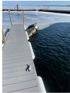
Float damaged from the ice

As spring nears, Dock & Yard has a big list of “To-Do’s” that need to be completed before boats splash and will require help from many volunteers.