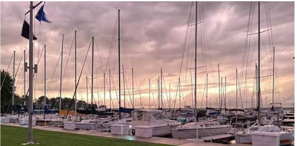
on 8.12.21 after the storms that rolled through!