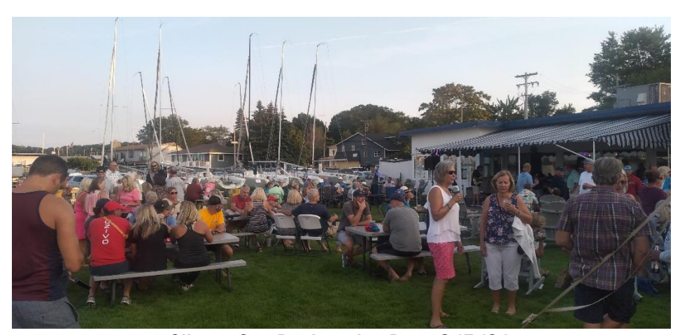
Clipper Cup Registration Party 8/5/21