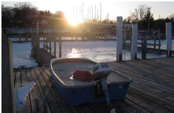
Old docks, iceboats, and ice-filled boats.