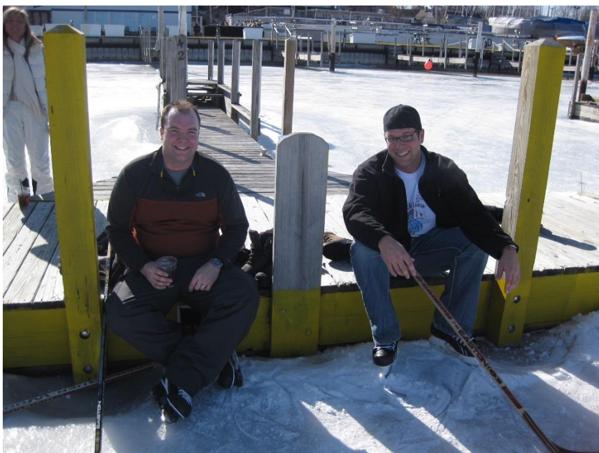
Can you believe that one day, both of these Yahoos would serve as Commodore?