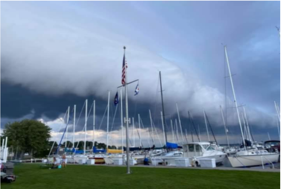
Amazing Photo of the Storm Clouds over MYC 7/26/2020