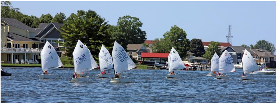
“Flashback” Junior Sailing 2019

http://www.muskegonyachtclub.org/myc-juniors/mjsa/