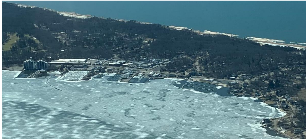
Muskegon Lake & Lake Michigan - Photo Credit to Brad Fisher (3/2019)