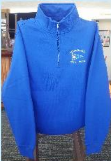
Quarter zip sweatshirts