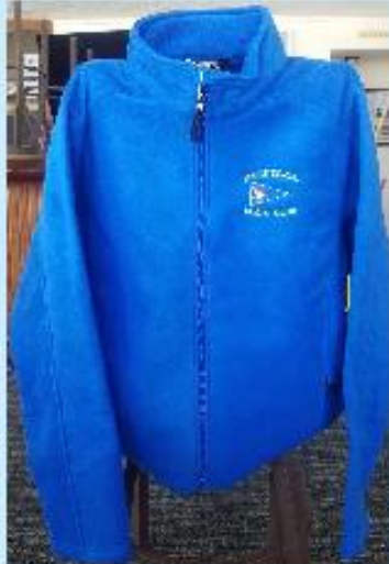
Full zip fleece w/pockets

We still have plenty of MYC Gear in stock!