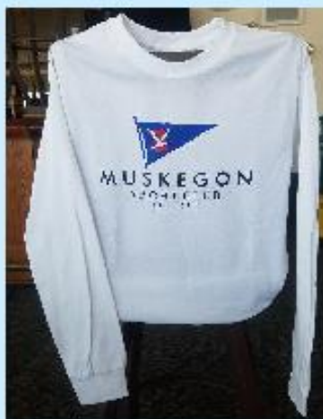
Long Sleeve Shirts Available in Cotton & Dry Wick