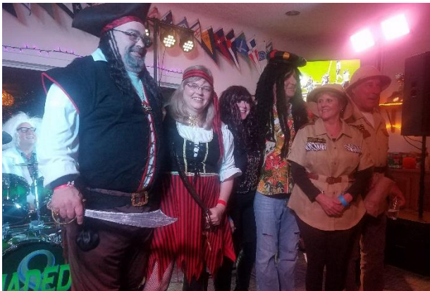
Best costume contest