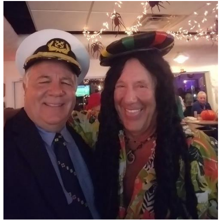
Nights mixed up: Bud thought it was the Commodore's Ball night. With Spooly.