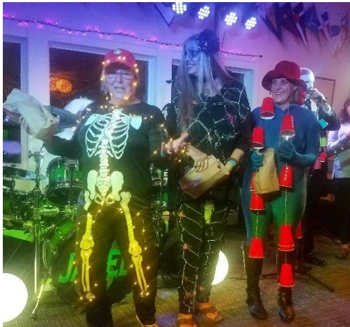
Best female costumes