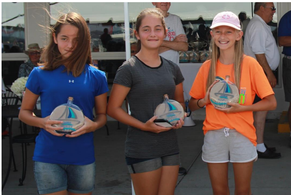
It was all grins as all three Optimist sailors tied for first!