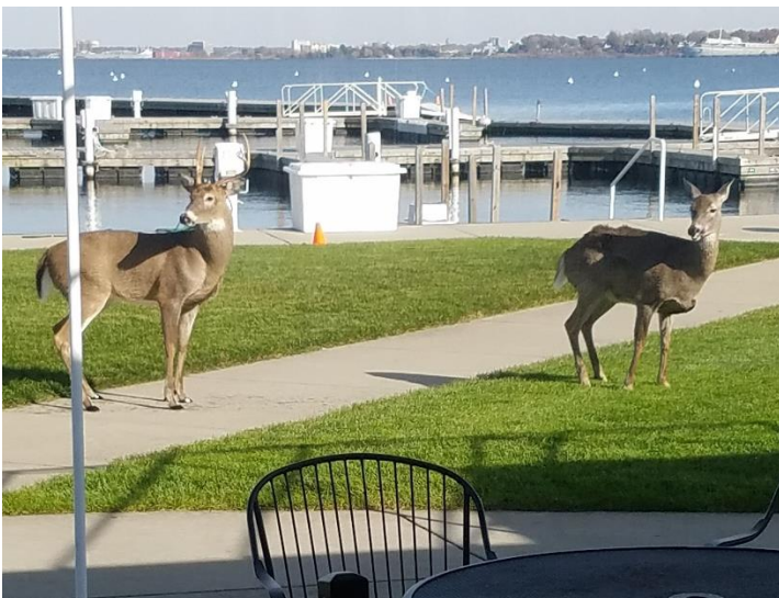
MYC had some visitors on the lake side lawn on 10/31/18!!

https://www.facebook.com/Muskegon-Junior-Sailing-Program-134232283314396/