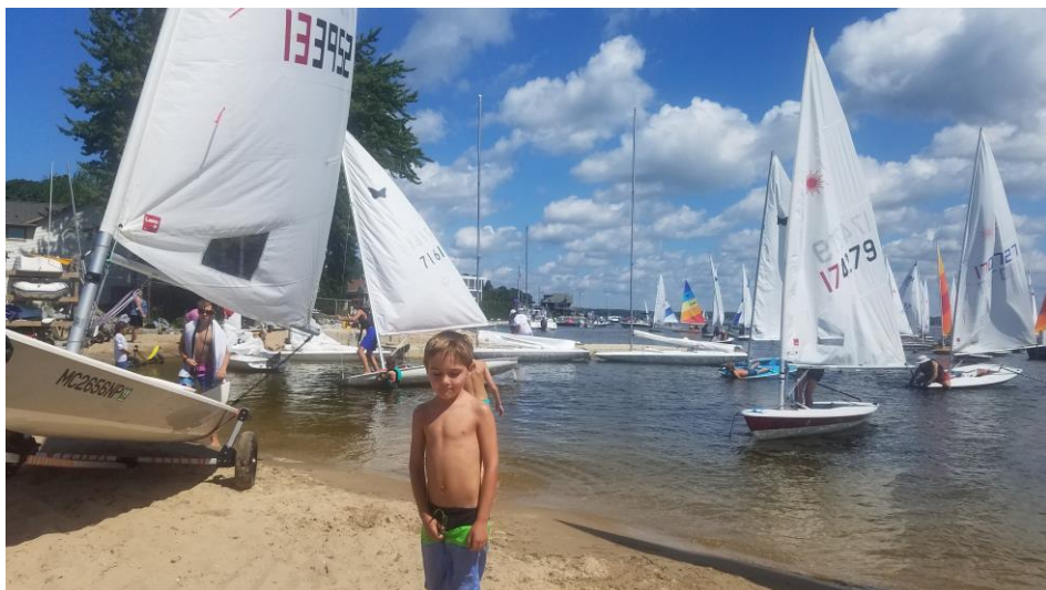
Close one-design racing means everyone coming in at the same time