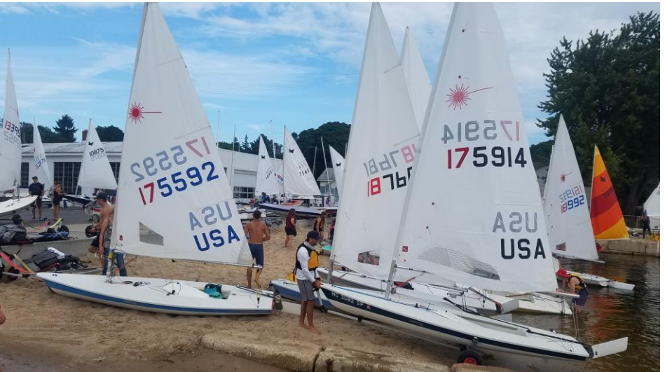
Lasers were launched off the beach