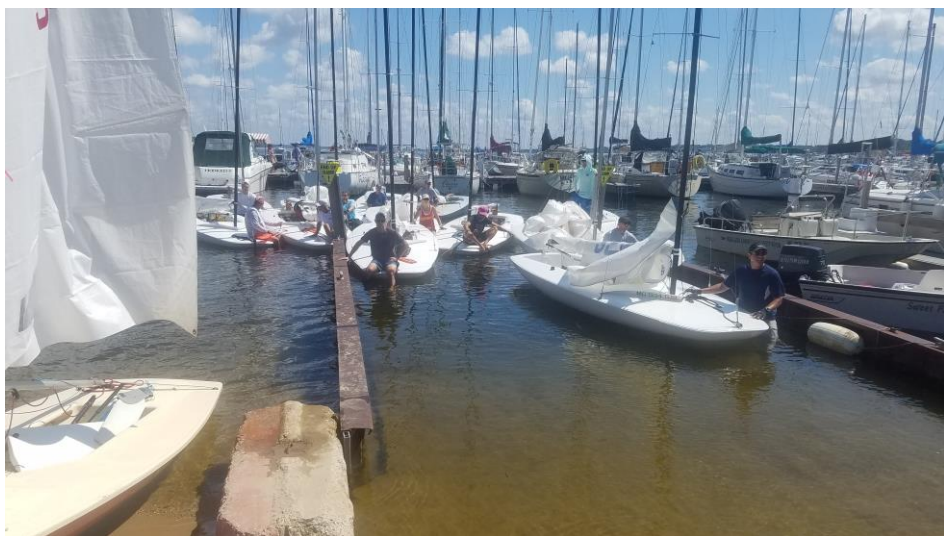
C Boats haul out line-up