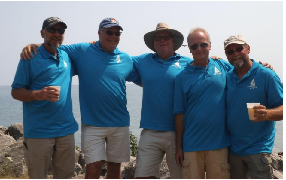
Team Sea Hawk