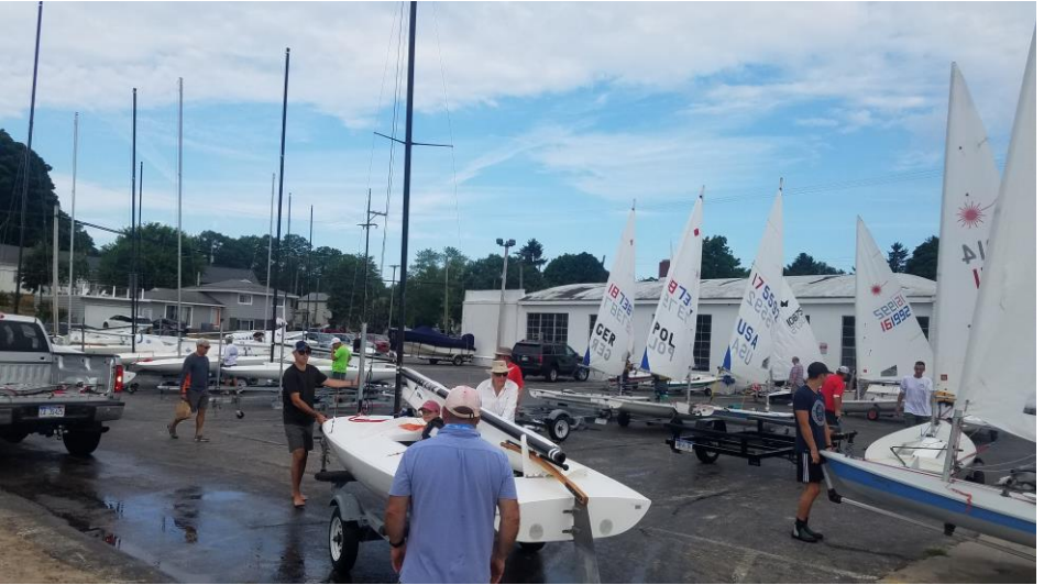
Many volunteers working staging the boats for launch and haul made for smooth sailing for the regatta competitors