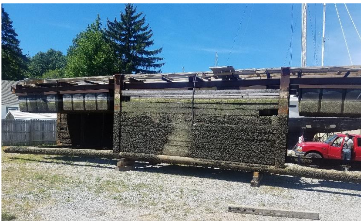
Damaged attenuator section

Bud Ainsworth Commodore 616-638-1676 cbainsworth@gmail.com