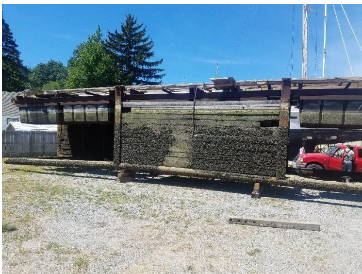
Damaged outer dock section

Leading off this month with an outer dock update: The first (and worst) section was pulled from the water on July 11th. Hanover Insurance had an adjuster here on the 20th of the month to determine a dollar amount to repair the pulled section (there are 5 sections). It was generally agreed that the first section is too badly damaged and beyond repair. We are currently waiting to hear a dollar amount (should be this week) from Hanover on what they will pay out to us on the first section. This dollar amount then can be applied to a new design of our choice. This is going to be a step by step process for each section.