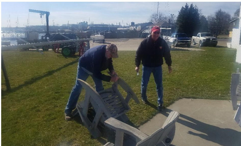
Rocker technicians tuning up the chairs for summer