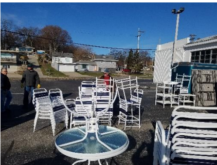
Summer's almost here once the pool furniture comes out!