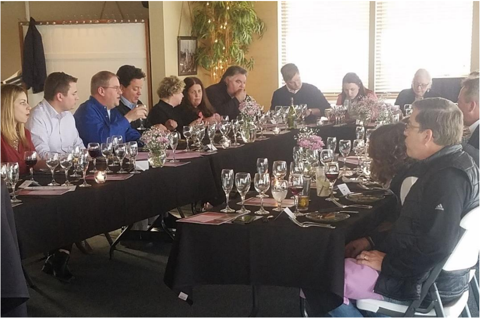
Wine Dinner 3/29/18 featuring South American cuisine