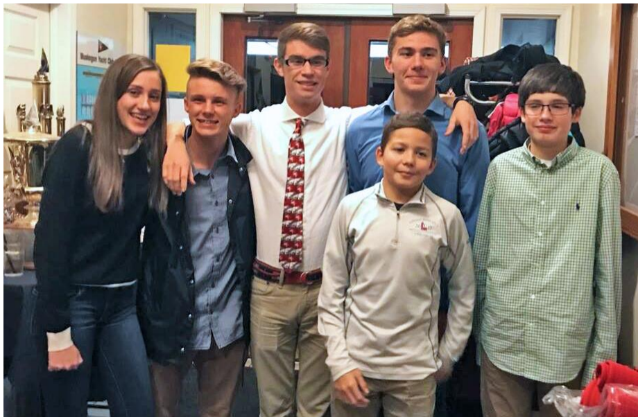
MYC Junior Sailors at the annual Awards Banquet on November 11