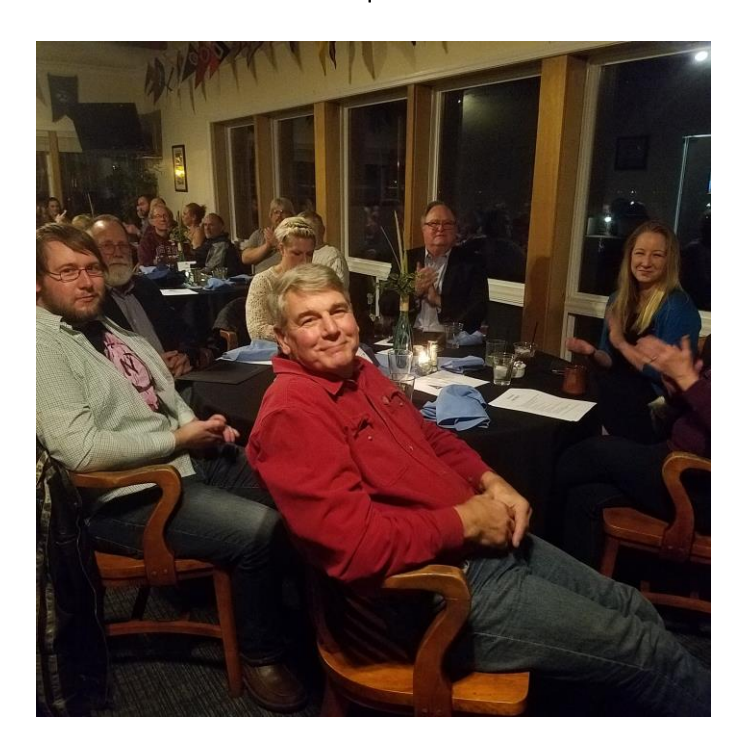
The MYC 2017 Awards Banquet was held November 11<sup>th</sup>