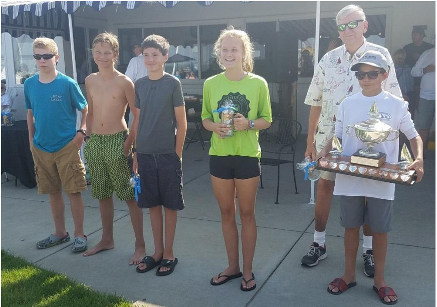
Harbor Hospice Regatta August 19 th