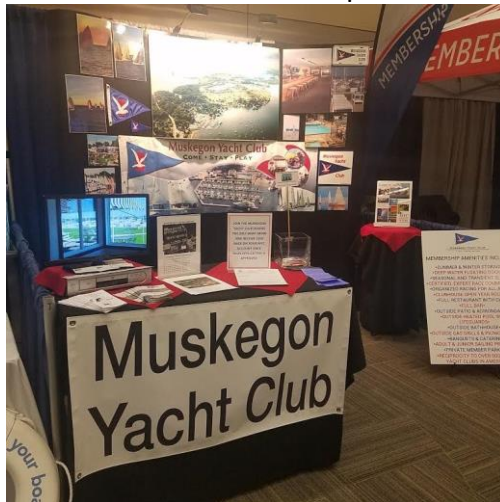
MYC's Booth at the Grand Rapids Boat Show