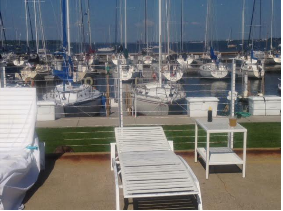
The staff had a wonderful time sailing on Spectra and swimming in Lake Michigan