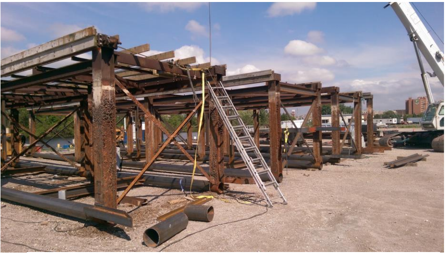
Four dock sections rebuilt. A fifth section is already back in the water.

Boats are in! White Lake Dock & Dredge is making progress on the re-fabrication of our dock sections. Some sections will be returning shortly and the last two will be taken away for fixing. Once they are all back in place we will be fixing the gangways and minor problems to main docks. Please do not park in areas with yellow paint as those are for boats. We are working hard at keeping a flow throughout our lot without bottlenecks. Painting of the Octagon building and Hoist to be completed shortly. Replenishing beach sand is being contracted out.