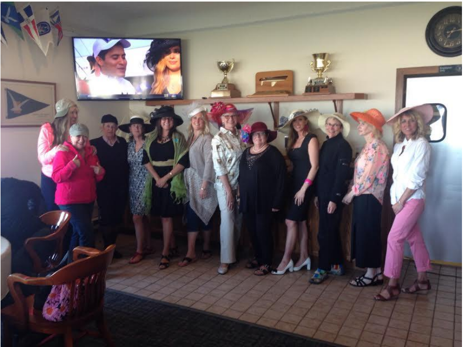
Kentucky Derby Party May 7 th