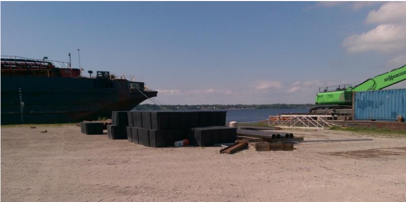
Some of the new floats ready to be installed.