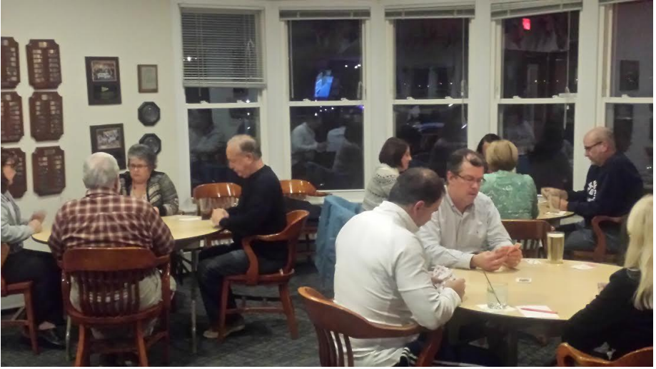
“Euchre Regatta” at MYC!