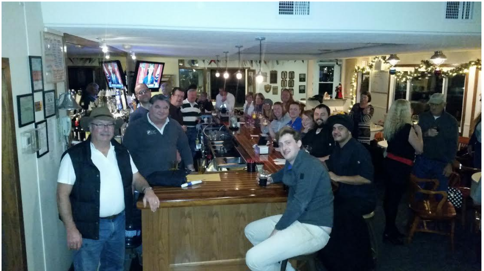
Roles were reversed on December 6 th when board members served the staff at a surprise Christmas party